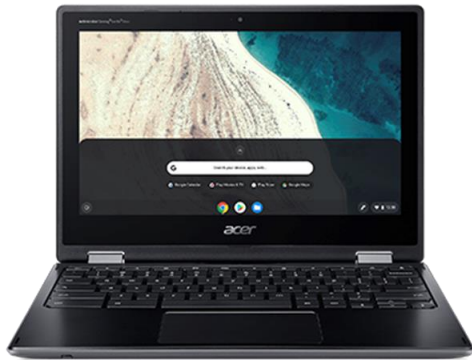
Acer R756TN Chromebook $613.60