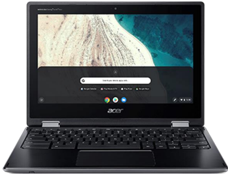
Acer R756TN Chromebook $613.60