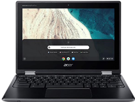
Acer R756TN Chromebook $613.60